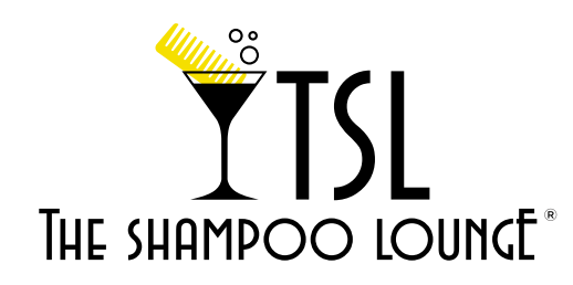
The Shampoo Lounge Location: Bali